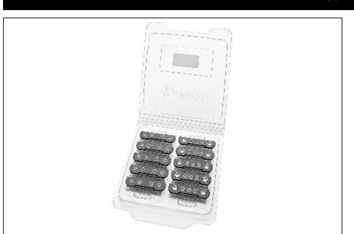
Figure 15–1 — SurfMates; Five pair sets

Table 15-2 — Material properties of SurfMate components