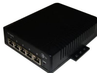
TP-SW5G-D (802.3af/at) TP-SW5G-NC TP-SW5G-MULTI TP-SW5G-24 (802.3af/at)