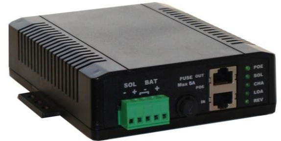
TP-SCPOE Charge Controller