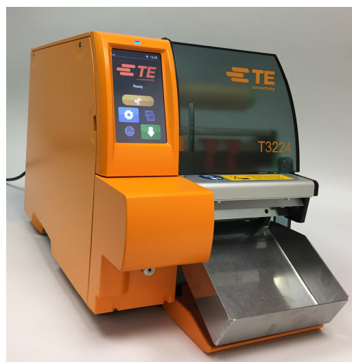
T3224 fitted with a Cutter & catch tray