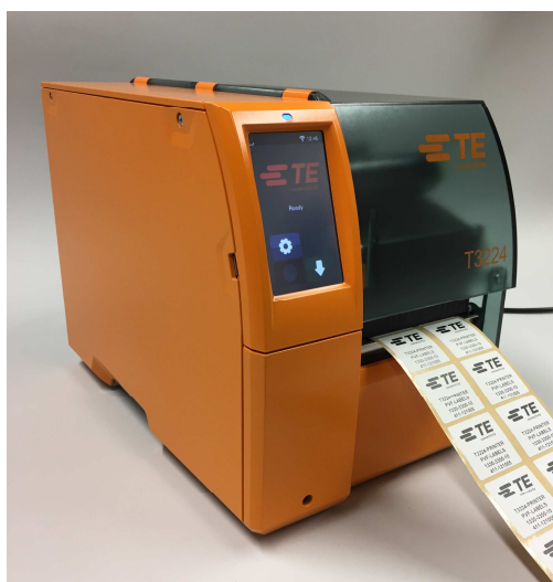
T3224 printing labels

For more details regarding printer accessories please consult TTDS-260, and for more details concerning the Universal payoff please consult TTDS-259.