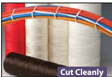
Cut Cleanly Scissors

Cable lacing - easy to learn, quite inexpensive, looks more attractive, and is a superior method of bundling wires in your boat.