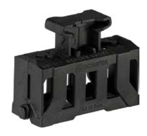
ESO 10.3x38 Fuse Inserter/Extractor with Cover Function for 10.3x38 \ mm Fuses in Clips, Patent Pending