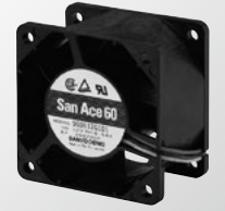
(Ribless model depicted)