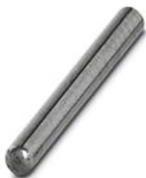
Connection pin, for combining multiple safety levers. Used with fuse carriers without spacer.

Please be informed that the data shown in this PDF Document is generated from our Online Catalog. Please find the complete data in the user's documentation. Our General Terms of Use for Downloads are valid ( http://phoenixcontact.com/download )