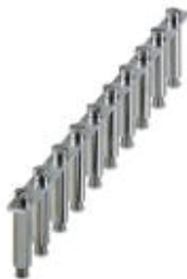
Fixed bridge, pitch: 13 mm, number of positions: 10, color: silver

Please be informed that the data shown in this PDF Document is generated from our Online Catalog. Please find the complete data in the user's documentation. Our General Terms of Use for Downloads are valid ( http://phoenixcontact.com/download )