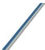
Continuous plug-in bridge, length: 500 mm, color: blue

Continuous plug-in bridge - FBST 500-PLC BU - 2966692