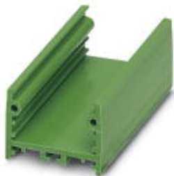
Panel mounting base, length: 1000 mm, Lower part, color: green, width: 1000 mm, Note: required profile length = PCB length - 3 mm

Please be informed that the data shown in this PDF Document is generated from our Online Catalog. Please find the complete data in the user's documentation. Our General Terms of Use for Downloads are valid ( http://phoenixcontact.com/download )