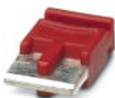
Single plug-in bridge, length: 6 mm, number of positions: 2, color: red

Single plug-in bridge - FBST 6-PLC RD - 2966236