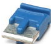
Single plug-in bridge, length: 6 mm, number of positions: 2, color: blue

Single plug-in bridge - FBST 6-PLC BU - 2966812