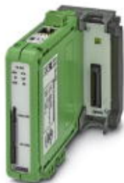
Head station for basic system functionality, no monitoring of PROFIBUS networks

Please be informed that the data shown in this PDF Document is generated from our Online Catalog. Please find the complete data in the user's documentation. Our General Terms of Use for Downloads are valid ( http://phoenixcontact.com/download )