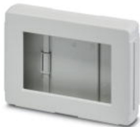
Display housing, 7", light gray, central window, front level, consisting of two half shells, four front plates with screws

Please be informed that the data shown in this PDF Document is generated from our Online Catalog. Please find the complete data in the user's documentation. Our General Terms of Use for Downloads are valid ( http://phoenixcontact.com/download )