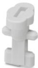
Locking element for locking the PCB onto UM-BASIC/PRO housing at level 3

Please be informed that the data shown in this PDF Document is generated from our Online Catalog. Please find the complete data in the user's documentation. Our General Terms of Use for Downloads are valid ( http://phoenixcontact.com/download )