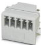
PCB headers, number of positions: 5, pitch: 3.5 mm, color: light gray, contact surface: Tin, pin layout: Linear pinning, solder pin [P]: 2 mm, Article with lateral pin exit

Feed-through header - MCO 1,5/ 5-G1R-3,5 KMGY - 2278351