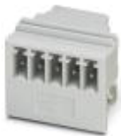
PCB headers, number of positions: 5, pitch: 3.5 mm, color: light gray, contact surface: Tin, pin layout: Linear pinning, solder pin [P]: 2 mm, Article with lateral pin exit

Feed-through header - MCO 1,5/ 5-G1L-3,5 KMGY - 2278380