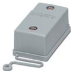
Protective cover, Protective covers, type: VC1, housing material: PA 6, color: gray

Please be informed that the data shown in this PDF Document is generated from our Online Catalog. Please find the complete data in the user's documentation. Our General Terms of Use for Downloads are valid ( http://phoenixcontact.com/download )