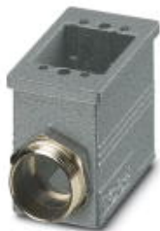
Coupling housing, made of metal, powder-coated type 1, number of modules 2, cable screw connection Pg16

Please be informed that the data shown in this PDF Document is generated from our Online Catalog. Please find the complete data in the user's documentation. Our General Terms of Use for Downloads are valid ( http://phoenixcontact.com/download )