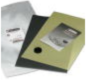
Polymer fiber polishing set, for F-SMA quick mounting connectors

Assembly tool - PSM-SET-FSMA-POLISH - 2799348