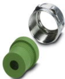
Half screw connection Pg16, made of metal, consisting of rubber seal with one hole and one pressure screw, for type 1 housings, cable [mm] 7 - 10.5

Please be informed that the data shown in this PDF Document is generated from our Online Catalog. Please find the complete data in the user's documentation. Our General Terms of Use for Downloads are valid ( http://phoenixcontact.com/download )