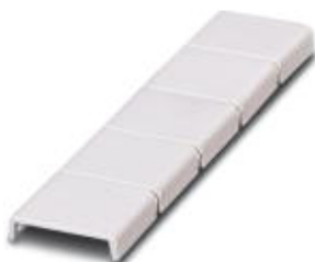
Marker labels, unprinted, 5-section, for individual labeling with M-PEN or CMS system, white

Please be informed that the data shown in this PDF Document is generated from our Online Catalog. Please find the complete data in the user's documentation. Our General Terms of Use for Downloads are valid ( http://phoenixcontact.com/download )