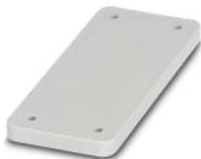
HEAVYCON cover plate, for wall cutouts of type B16, 7 mm thick, gray

Please be informed that the data shown in this PDF Document is generated from our Online Catalog. Please find the complete data in the user's documentation. Our General Terms of Use for Downloads are valid ( http://phoenixcontact.com/download )