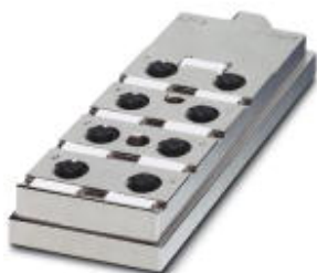
Sensor/actuator box, connection method: M12 socket Metal, number of slots: 6, number of positions: 5, coding: A - standard, slot assignment: Parallel, status display: No, Universal, shielding: yes

Please be informed that the data shown in this PDF Document is generated from our Online Catalog. Please find the complete data in the user's documentation. Our General Terms of Use for Downloads are valid ( http://phoenixcontact.com/download )