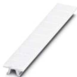
Zack marker strip, 10-section, horizontally labeled with the consecutive numbers: 291 ... 300, white, width: 6 mm

Please be informed that the data shown in this PDF Document is generated from our Online Catalog. Please find the complete data in the user's documentation. Our General Terms of Use for Downloads are valid ( http://phoenixcontact.com/download )