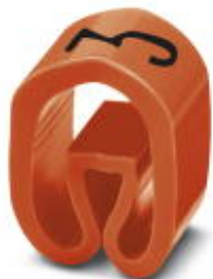
Conductor marking collar, Labeled with the number: Numbers, orange, width: 4.2 mm

Please be informed that the data shown in this PDF Document is generated from our Online Catalog. Please find the complete data in the user's documentation. Our General Terms of Use for Downloads are valid ( http://phoenixcontact.com/download )