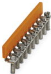
Fixed bridge, pitch: 8.2 mm, number of positions: 10, color: silver

Please be informed that the data shown in this PDF Document is generated from our Online Catalog. Please find the complete data in the user's documentation. Our General Terms of Use for Downloads are valid ( http://phoenixcontact.com/download )