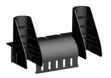
CMW-KIT Waterfall Kit