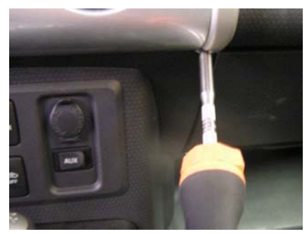
Lower screw location.

Read instructions completely prior to starting installation. All InDash Mounts are designed so that after installation, phone is facing normal driver position for left-hand drive vehicles. This mount is not designed to be used in foreign countries with right-hand drive vehicles. Use extreme care when working around the plastic components on the dash. Excess force, can cause breakage of the plastic components.