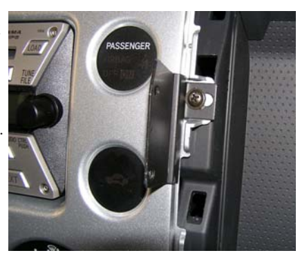
Part #34A prototype in place, right side.