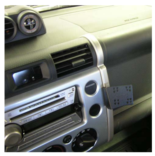
InDash installed showing Right side location.