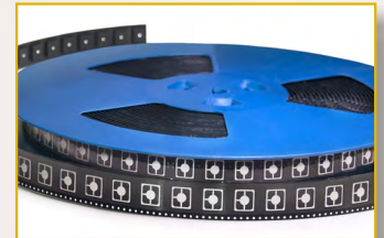
Frame shown in tape & reel packaging