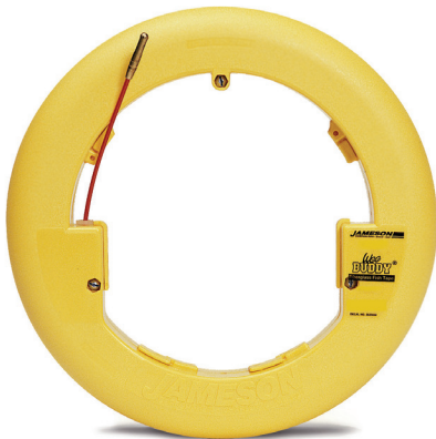
WEE BUDDY® FISH TAPE