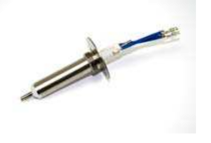
Click Picture to Enlarge

Item No. / Description MSLP Stock Status