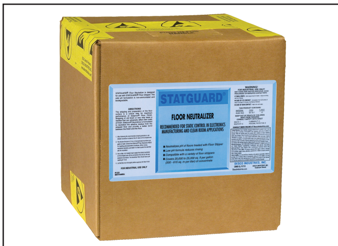
Figure 1. Statguard® Floor Neutralizer: 2.5 gallon bag-in-box