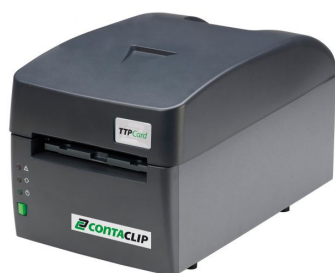
Thermal transfer printer