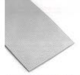
[click to enlarge]